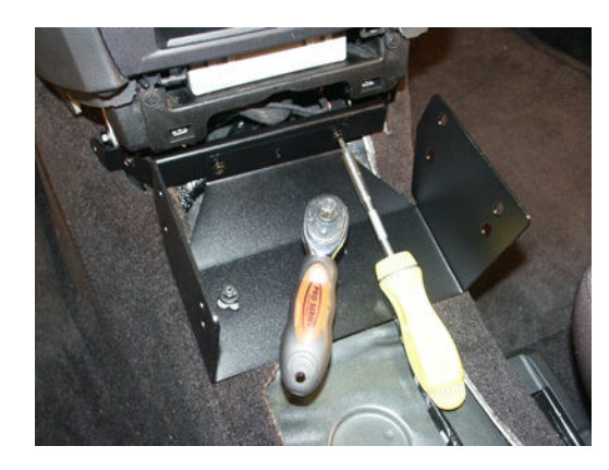
Attach support bracket for stout console (#2) to vehicle and to frame support bracket using OEM hardware and #10 x ½" phillips machine screws and washers

Note: Due to some slight differences on the OEM floor mount bracket, tabs with mounting hole may need to be bent slightly to accommodate the console front support bracket. Bending these tabs can easily be done using pliers.